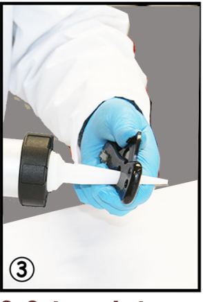
3. Cut nozzle to desired opening