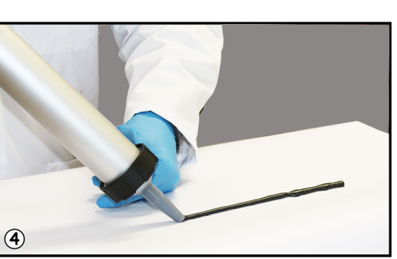
4. Squeeze trigger to dispense material (you will hear a "pop" as the nozzle punctures the sausage pack)