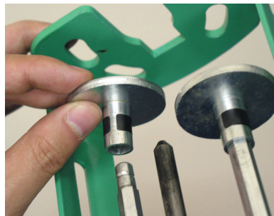
Patented Snap In/Snap Out Push Disks